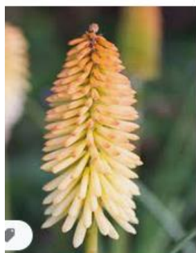
Kniphofia Moonstone eternysen.com · Op voorraad