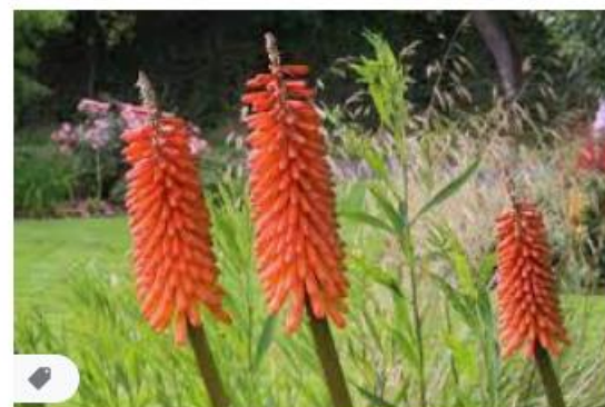
Kniphofia 'Alcazar' – Ballyrobert Gardens ballyrobertgardens.com · Op voorraad