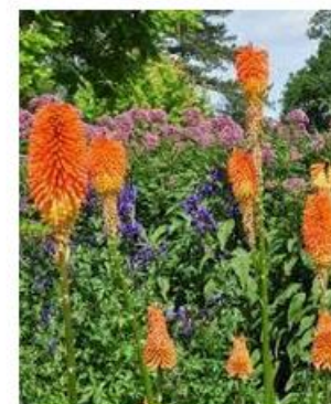
Kniphofia - vuurpijl , soo... kwekerijennederland.nl