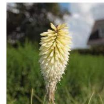
Kniphofia Archives - Bouwme... bouwmeesterplants.nl