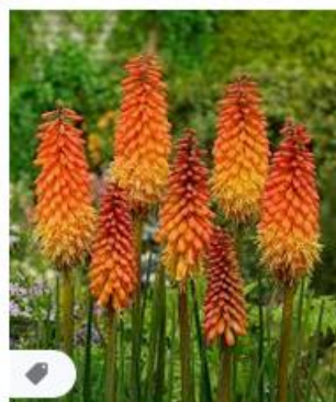
Kniphofia Alcazar | J Pa... jparkers.co.uk · Op voorraad