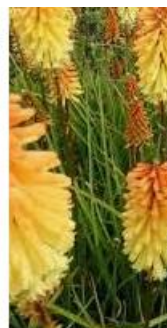
Vuurpijl of de tuinadvies.nl