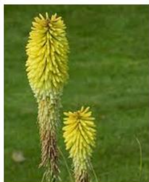
Kniphofia 'Percy's Pride... appeltern.nl