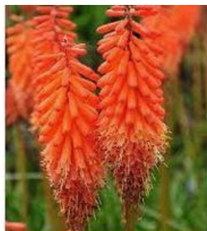
Kniphofia - vuurpijl , so... kwekerijennederland.nl