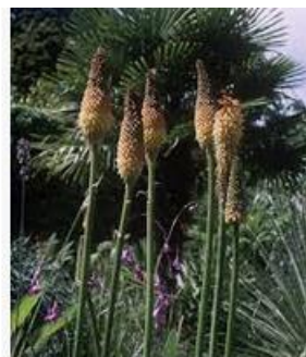
Kniphofia 'Alcazar'[red-... rhs.org.uk